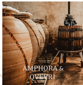
AMPHORA & QVEVRI